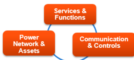
Figure 2: MASERA pillars

One of MASERA main objective is to demonstrate that innovative and rugged solutions are not opposed, and can be complementary, ensuring overall efficiency and affordability.