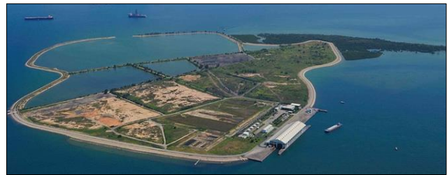
Figure 1: Semakau island, South of Singapore